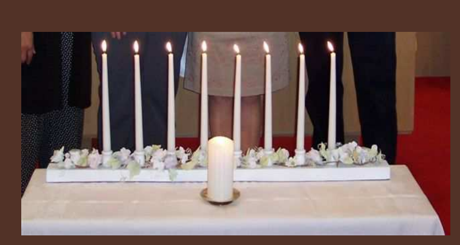
During this time we remember those who have left us a great heritage, who have left their print on our church family. Indeed, we have been surrounded by a great cloud of witnesses who have passed on to us their faith..

I have fought the good fight, I have finished the race, I have kept the faith. Now there is in store for me the crown of righteousness, which the Lord, the righteous Judge, will award to me on that day—and not only to me, but also to all who have longed for his appearing. 2 Timothy 4:7-8 NIV